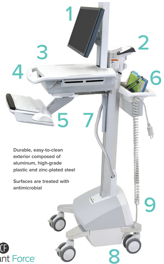
SV42 LCD Pivot cart

Durable, easy-to-clean exterior composed of aluminum, high-grade plastic and zinc-plated steel